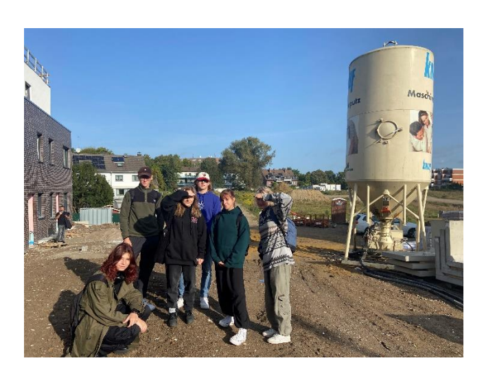
Construction company, Essen