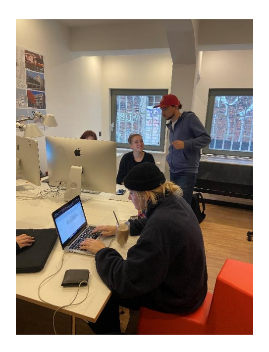
Architektur team, Dortmund

The girls practised in Dortmund at the architectural firm Architektur team where they used the AutoCad and Revit programs and also tried working in the new ArchCad program under the supervision of experienced architects.