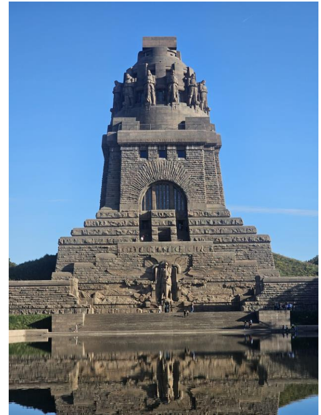
Monument to the Battle of the Nations